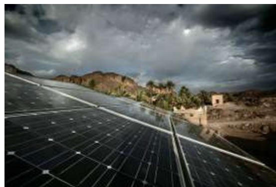
Photovoltaic Micro-plants by Isofoton (Morocco) – CC3 license.

In as much as it is possible, research may focus further on an analysis and recommendations on response measures and on the recourse routes to investors acting and relying upon countries' policy ambitions and NDC provisions within the relevant national legal and institutional frameworks. This could include the types of remedies that should be available to ensure a favourable investment climate. It may also include recommendations on implementation roadmaps, highlighting possible mechanisms and measures at sector and sub-sector level, policy changes and regulatory reforms, institutional capacity and investment needs.